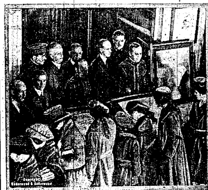
Scene in the state department library, Washington, showing some of the thousands that have viewed the nation's most precious documents since they were opened to public inspection. The originals were shown of the Constitution of the United States, the treaty between the colonies and England, (1783) by which the United States gained its independence; the Declaration of Independence, Lincoln's emancipation proclamation, the Spanish-American war treaty, minutes of the continental congress, and the treaty between Washington and the Northwest Indian tribes.