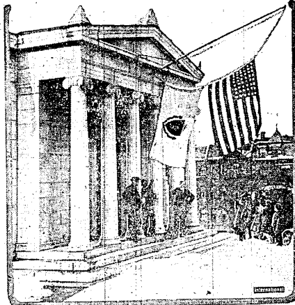
After an inspection of the Bunker Hill monument by the state engineers, the commonwealth of Massachusetts has formally taken over the care of the monument from the Bunker Hill association. It was found that the monument was badly in need of repairs. The photograph shows the Massachusetts state flag being hoisted over the entrance to the monument.