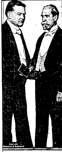
Charles Evans Hughes, presenting to Herbert C. Hoover, at a meeting in Carnegie hall, New York, the Civic Forum medal of honor for distinguished public service.