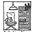
A chair, a lamp, bookshelves, a pretty pillow.