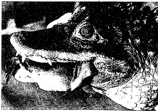
Chubb's favorite dinner is rainbow trout.

"People just don't understand them because they're so different from themselves," she said. "But they're not