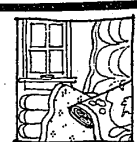
Maybe some Marimekko will help.