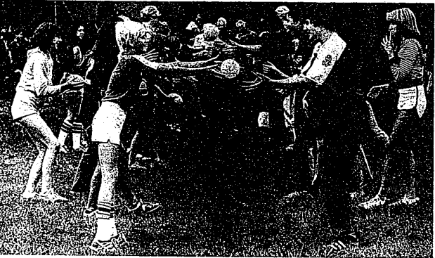
A heavy wind played havoc with the water-filled balloons going back and forth before a winner was declared with the last balloon intact.