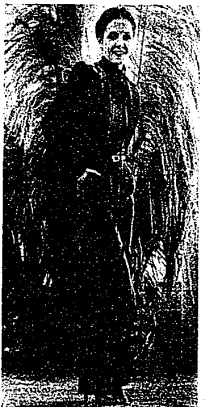
Versatile is the word for the black velvet jacket (above left) which can complement a wool plaid skirt by day and top silk trousers for evening. The same jacket (above right) can team up with the grey suit skirt, camisole top and a waist-cinching belt to go to dinner. At far right, another wardrobe basic is a good black all-wool melton coat, double-breasted and warm enough to ward against winter chills.