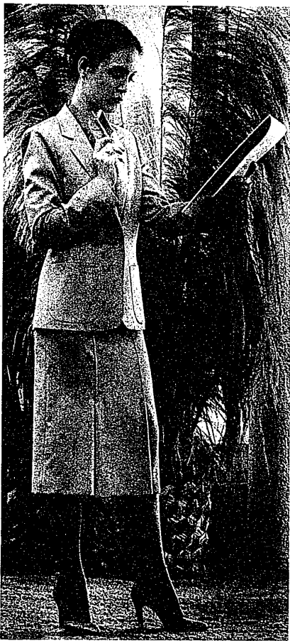
Dove grey is the color and basic is the theme for this gabardine classic suit with matching grey and black print blouse.