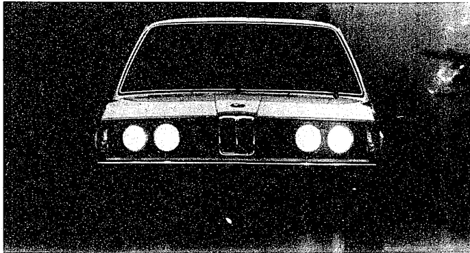
*Our fuel efficiency figures are for comparison purposes only. Your actual mileage may vary, depending on speed, weather and trip length. Your actual highway mileage will most likely be lower. © 1980 BMW of North America, Inc. The BMW trademark and logo are registered trademarks of Bayerische Motoren Werke, A.G.

THE ULTIMATE DRIVING MACHINE. BMW: MÜLLER & CO. BRANDY