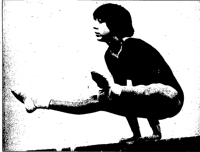
Perfect form on the balance beam, as well as in three other events during the national championship meet, gave the ninth-grader at Farmington High School her new title.