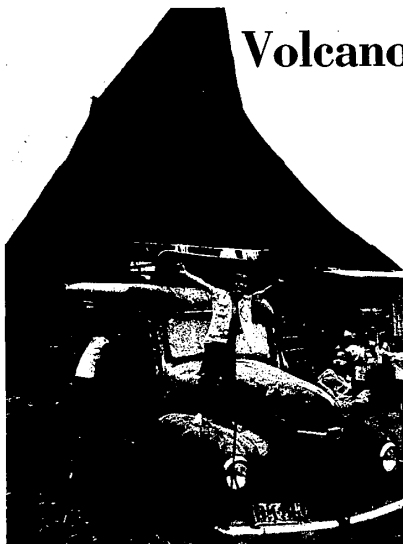
An old car is playground equipment for Batak children on Samosir Island in the center of Lake Toba in Sumatra. The Bataks live in dwellings such as the 300-year-old traditional structure towering in the background.

"A child's father has little role to play," a Minangkabau guide explained. "It's the uncle — the mother's brother — who sees to the child's welfare." Many Minangkabau men have left Sumatra to pursue their own fortunes in Java.