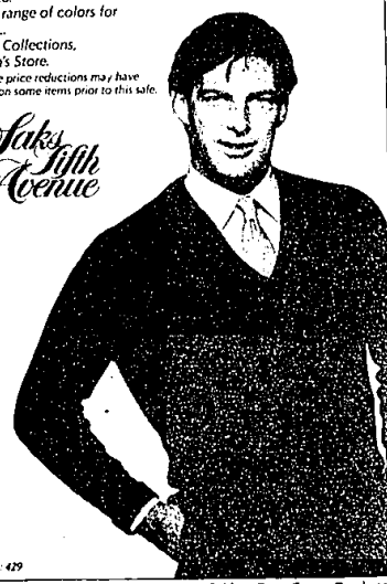
479 Somerset Mall, Big Beaver at Coolidge, Troy • Fairlane Town Center, Dearborn