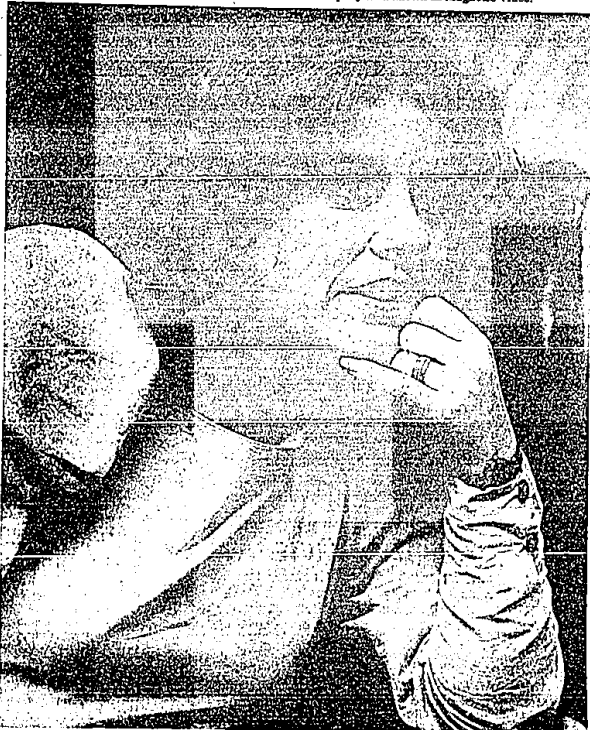
'The Lamaze Method' videocassette will be available at video stores at the end of the month.