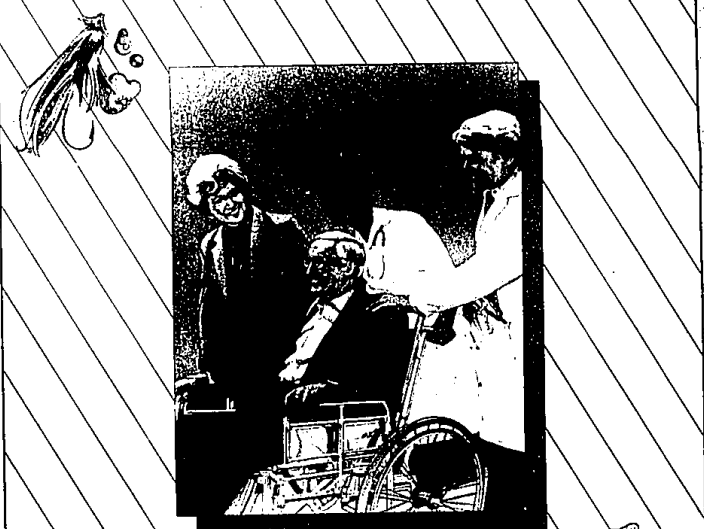
Because a little pampering makes the getting better go faster.