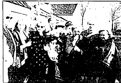
Michigan Opera Theatre Murder Mystery cast rehearses at McCabe Funeral Home in Farmington Hills.

FASHION SHOW AND LUNCHEON: On April 3 at Bloomfield Hills Country Club to benefit the Women's Committee of Oakland Family Services. "Don Your Spring Bonnet." Fashions by Jacobson's.