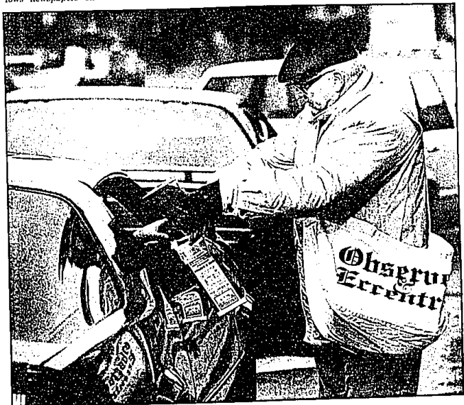
Back to work: It's that time of the year when old newsboys come out of retirement to sell special edition Goodfellows newspapers.

ANN ARBOR • GROSSE POINTE • BIRMINGHAM • DEARBORN • ROCHESTER • LIVONIA Shop until 9 p.m. on Thursday and Friday, until 6 p.m. on Monday, Tuesday, Wednesday and Saturday, Sunday Noon to 5 p.m. Jacobson's Charge, MasterCard®, VISA®, and American Express®.