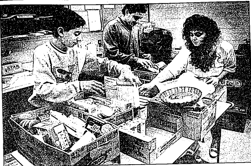
Helping hands: Goodfellows organizations throughout Oakland County prepare holiday food baskets (above) for area needy families. Firefighters in Farmington (right) help the local Goodfellows cause, soliciting donations from motorists.