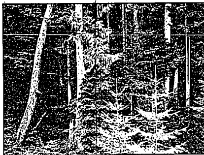
Branching out: The tremendous contrast range and the bare diagonal trunk combined to attract Monte Nagler's eye for this forest photograph he made in Washington's Olympic National Park.

make better photographs in the forest. For good composition, concentrate in one of two areas: patterns or a dominant point. I have found that patterns of trees work well in a picture, such as an even row of aspens contrasted against the dark interior of the forest. A dominant point of interest can be an unusually shaped tree, a predominant tree trunk in the foreground framing trees behind, or a cluster of foliage on an individual branch. Remember to keep things simple and try to add impact to your shots. As always, pay close attention to depth-of-field. Most likely, you'll want everything sharp from front to back, so be sure to use a small aperture and your depth-of-field scale on the lens barrel. And because it's usually darker in the woods, using a small aperture (necessitating a longer shutter speed for correct exposure) will likely require a tripod. Forests provide many other photo opportunities. Look closely