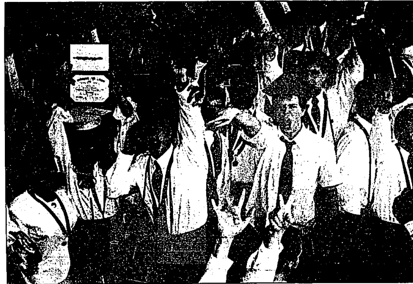
Glad and gone: Farmington High graduates whoop it up after receiving their diplomas.