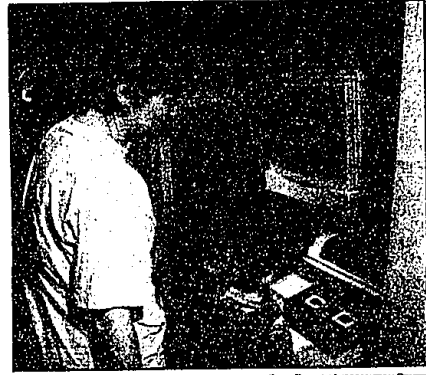
COOK ENERGY INFORMATION CENTER

Send photos and travel recommendations to Keely Wygonik, Entertainment Editor, Observer Newspaper, 36251 Schoolcraft, Livonia, MI 48150. For more information, call (313) 953-2105. We're also looking for recommendations for good places to go with families — overnight, for a weekend or week. What's your favorite winter getaway? Is it some place warm or cold?