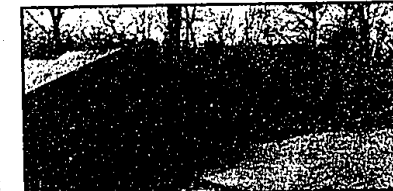
CITY OF BLOOMFIELD HILLS Private wooded ravine setting of over 2 acres. Custom designed 3 bedroom, quad-level with lots of living space. Family room with wet bar, library, large 3 car garage. $379,700 KEN112