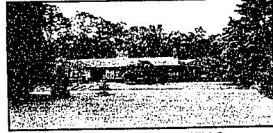
CITY OF BLOOMFIELD HILLS Prestigious Fudgate area with over an acre of wooded grounds. Five bedrooms, extra large room sizes, great Florida room, greenhouse, too. Location! Location! $595,000 LOM621