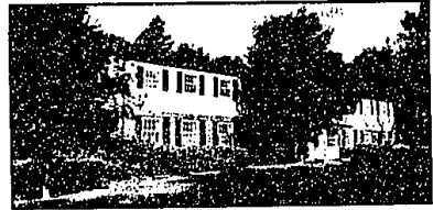
BLOOMFIELD Peaceful, private and picturesque! Spacious with first floor in-law suite, 3 fireplaces, master with library and luxurious bath. Lake privileges on a peaceful, tranquil lake. $485,000 CRA287