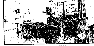
LOVELY SETTING Updated contemporary ranch on an acre and lot. Lower level guest suite with kitchen and private entrance. Total 5 bedrooms, 4 1/2 baths, quality kitchen, 4 car garage. $749,000 CRE382