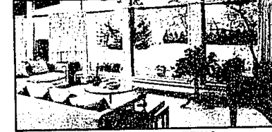
GOLF COURSE SETTING Large contemporary on 1.4 acres backing to the third green of Bloomfield Hills Country Club. Large country kitchen with fireplace, 5 bedrooms, library. Premium land! $550,000 LAH371