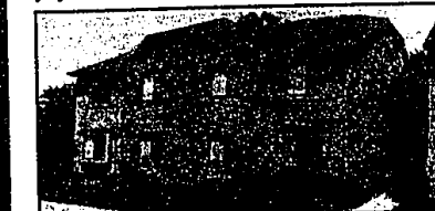
LATHRUP PARK Contemporary condo decorated by Interiors, Fireweed. Beautiful kitchen with new appliances, fireplace, deck overlooking wooded view. Call for more specifics. $105,900 EYE274