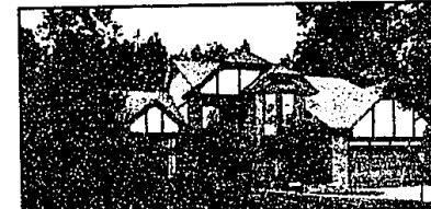
BACKS TO WOODS Quality abounds in this great home! Corian counters, fieldstone fireplaces in living room and elegant master suite with Jacuzzi, lovely leaded glass, cherry wood accents. $394,000 FOX304