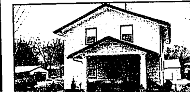
CITY OF BIRMINGHAM Great price for this charming 3 bedroom home! Hardwood floors, new furnace and air, newer landscaping are but a few of the highlights. Fenced yard. Detached garage. $129,900 HUR159