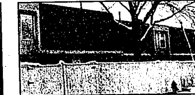
CITY OF BLOOMFIELD HILLS Private ravine setting for this great Cranbrook Manor condo. Both bedrooms have private baths, master has dressing area, also. Newer kitchen appliances. Popular area! $159,900 STR970