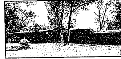
SPECTACULAR LAKEFRONT Magnificent contemporary. Gourmet kitchen with granite topped island, hardwood floor, Gaggenau and Sub Zero. Open in design with cathedral ceilings, skylights and wonderful views! $549,000 LOC135