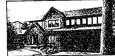
FARMINGTON HILLS Elegant colonial with high ceilings, two stairways, 3 fireplaces, lots of windows, skylite, ceramic and hardwood floors, decking, basement with second kitchen. $379,900 FOX382