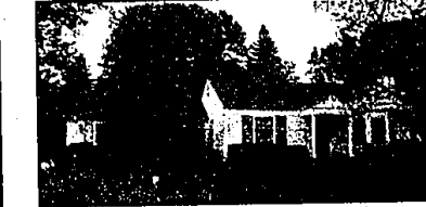
ROYAL OAK Double lot with mature trees. Living room with large bay windows, hardwood floor and fireplace. Library, lovely patio and in a great area! $165,000 MUR121