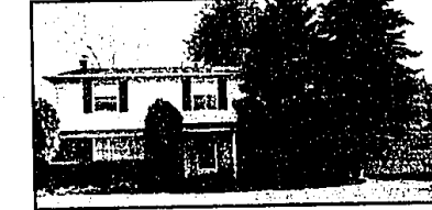
GREAT FAMILY AREA Updated Birmingham Farms colonial. Beautiful hardwood floors in foyer, living room and dining room. New kitchen, new powder room. Bloomfield Hills schools. $189,900 WOO657