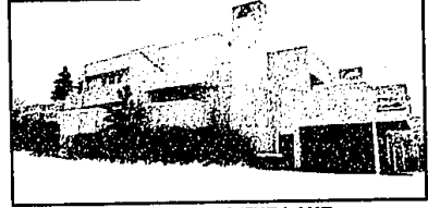
OVERLOOKING THE LAKE Beautiful setting for this spacious 3 story home. First floor master suite with luxurious bath. Euro-Kitchen with oak floor, granite island! Lots of marble, mirrors and skylights. $505,000 ALE178