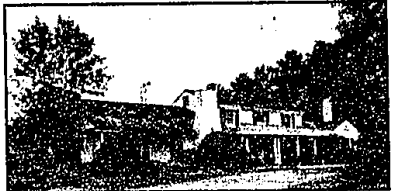
HEART OF BLOOMFIELD HILLS Private estate in the City with close to Cranbrook location. Lovely marble foyer and dramatic center atrium for an impressive entry. Large country kitchen with fireplace. Private setting. $1,500,000 DUN378