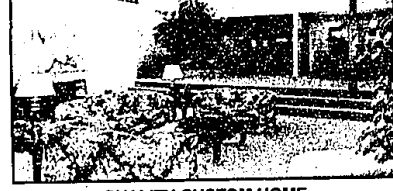
QUALITY CUSTOM HOME Dramatic entry to great room with vaulted ceiling and magnificent view of beautifully treed grounds with spring fed pond. Open floor plan for family living or entertaining asse. $895,000 BEA 475