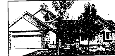
ROCHESTER HILLS Popular location for this "shows like a model" home! Quality throughout with cathedral ceilings, first floor master, island kitchen and more. An excellent value! $249,000 KEN211