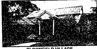
BLOOMFIELD VILLAGE Large custom home with walk-out lower level, heated docking, lovely pool area and a beautiful setting. Spacious 6-8 bedrooms with luxurious first floor master with den, sauna and more. $1,350,000 QUA299