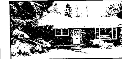
PRIVATE SETTING Updated decor, hardwood floors, marble fireplace, coved ceilings, plaster w.c. 1993 copper plumbing. Island kitchen with JenAir. Beverly Hills location. $134,900 BEN163