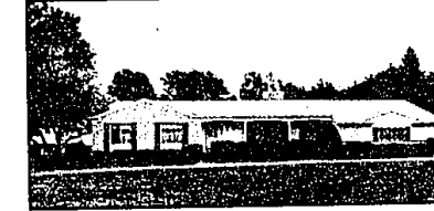
BLOOMFIELD Large ranch on a beautiful lot in a great area of Bloomfield. Custom home features large living room and family room with 2 way fireplace, full glass Florida room. $239,000 KEL525