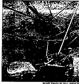
Watching the river run: Parts of the Middle Rouge tributaries still look quite scenic, but some need a little work, like this stretch west of Drake at Howard Street. The city of Farmington Hills has opted out of the Rouge River Rescue this year. The city plans to redirect its focus and work on managing woody debris.