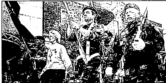
Parade march: Oakland County Vietnam Veterans headed down Grand River under a cloudy sky during Monday's Memorial Day parade.