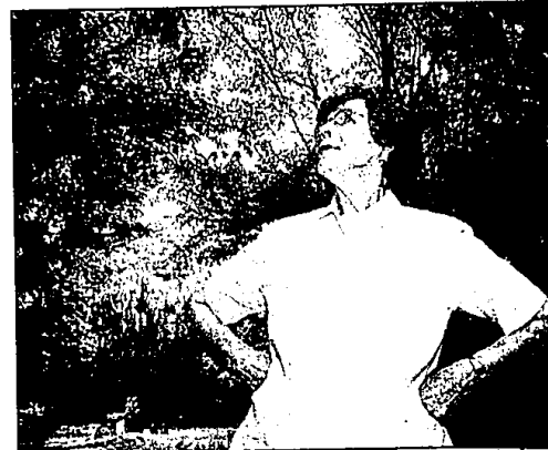
STAFF PHOTO BY BILL BERGER