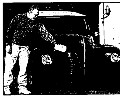
Please see AUTORAMA, A2