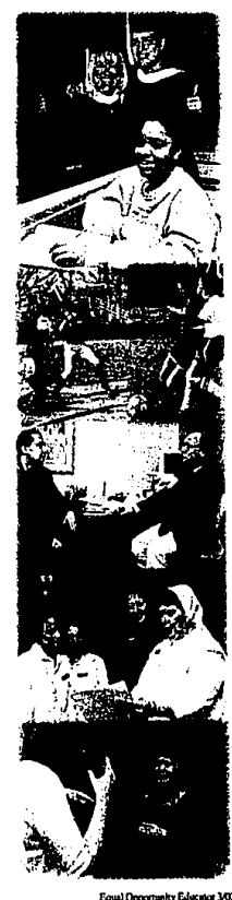
Equal Opportunity Educator 302