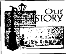
While the church is 100 years old, the congregation formed in 1876, with parishioners using other