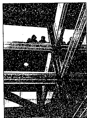
Workers examine the condition of the windows at the front of the theater.

facility was the premiere theater for the popular Eminem movie "Eight Mile." It also exceeded its first-year goal of 400,000 patrons.