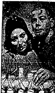
Louise Rainer and Paul Muni in "The Good Earth"

THE dramatic story of China's teeming millions, their struggles, their hardships, and the intensely human heartbeats of the great and title known nation, is transcribed from Pearl S. Buck's novel to the talking screen in "The Good Earth" starring Paul Muni and Louise Rainer, which opens on Sunday evening, April 25th, at the Cass Theatre. It will be shown twice daily thereafter at 2:30 and 8:30 p. m. Tickets are now on sale for all performances of this Metro-Goldwyn-Mayer triumph.