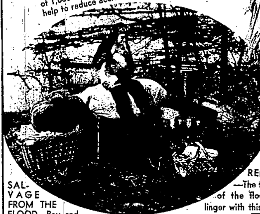
SALVAGE FROM THE FLOOD —Boy and dog view the family's worldly goods piled on river bank where Red Cross found them, provided shelter and care.