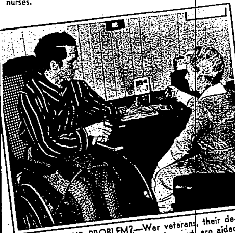
WHAT IS YOUR PROBLEM? —War veterans, their dependents, and service men, in hospital or out, are aided by Red Cross in solving their difficulties.

The Red Cross operates through 3,700 Chapters and their 9,000 Branches. Every one who joins through the local Chapter supports these services to the public.