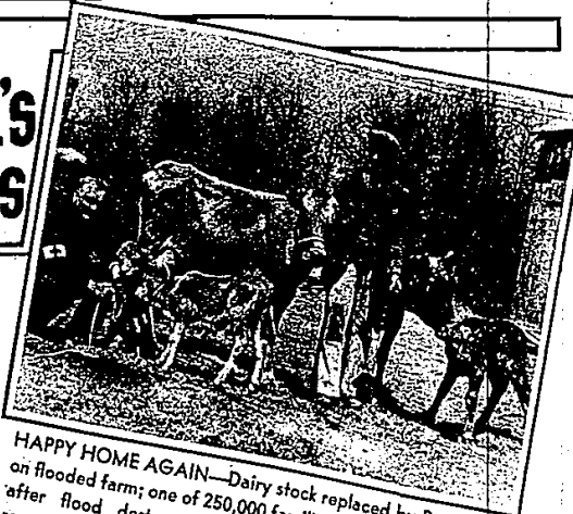
HAPPY HOME AGAIN —Dairy stock replaced by Red Cross on flooded farm; one of 250,000 families aided to self-support resources.