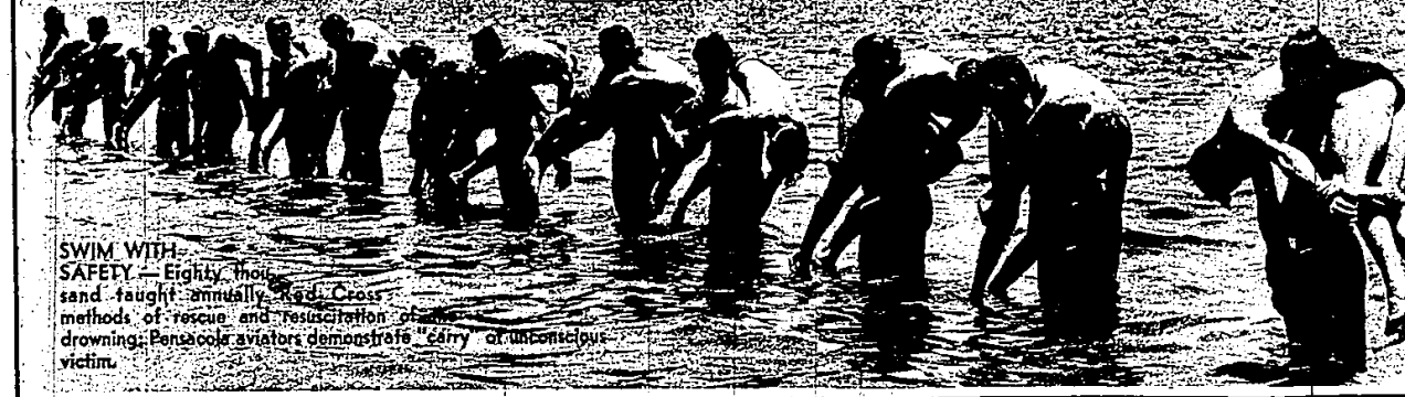
SWIM WITH SAFETY —Eighty thousand taught annually Red Cross methods of rescue and resuscitation of drowning; Pensacola aviators demonstrate carry of unconscious victim.