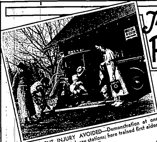
PERMANENT INJURY AVOIDED —Demonstration at one of 1,600 Red Cross highway stations; here trained first aiders help to reduce accident death toll.