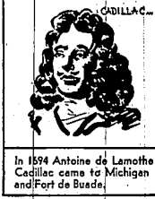
In 1694 Antoine de Lamoignon Cadillac came to Michigan and Fort de Buade.