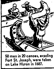
50 men in 20 canoes, evading Fort St. Joseph, were taken on Lake Huron in 1687.