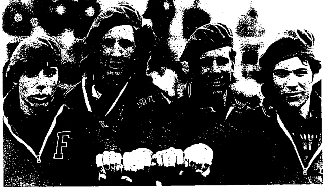
FASTEST 440 IN STATE — Making up Franklin's :44.1 relay team are from left to