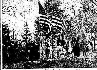
The annual Farmington Memorial Day ceremonies, pictured above, will be repeated this Monday at 10 a.m. The parade will form at 9:30 at the High School, and will be composed of veterans groups, the high school band, mothers' groups, Boy and Girl Scouts, Clarenceville's parade will form at 8 a.m. at Eight Mile and Grand River and will march to the Clarenceville Cemetery.