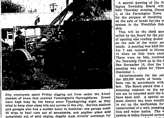
City employees spent Friday digging out from under the six-inch thick sheet of snow that covered Farmington's thoroughfares...