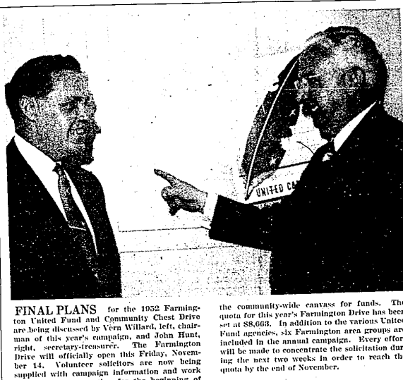
FINAL PLANS for the 1952 Farmington United Fund and Community Chest Drive will officially begin this Friday, November 14.

Farmington United Fund Campaign To Open Friday With $8,663 Goal Volunteer Solicitors Ready For Start of Annual Door-To-Door Canvass In Township And City