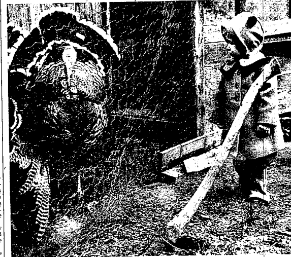
A sight of beauty is old "Tom Turkey" in his coat of brilliantly colored feathers. Thanksgiving has come, however, and the use must be made along with all the trimmings of stuffing, cranberry sauce, pumpkin pie and many other tasty foods.