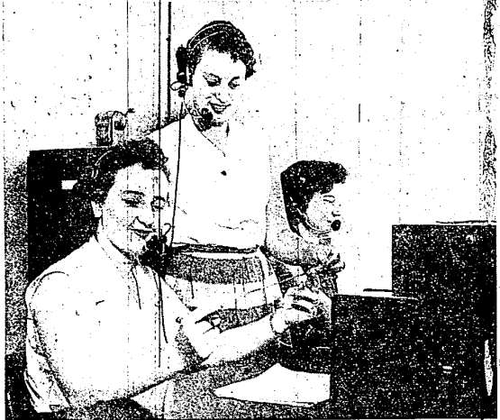
SPECIALLY trained operators of the Michigan Bell Telephone Company are calling more than 6,500 telephone users in the Farmington area to explain the operation of dial phones in preparation for the change-over to the dial system.