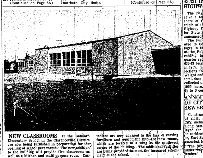
NEW CLASSROOMS at the Botwin Elementary School in the Clarenceville District are now being furnished in preparation for the opening of school next month. The new addition to the building will provide five classrooms as well as a kitchen and multi-purpose room. Classrooms are now engaged in the task of moving furniture and equipment into the new rooms which are located in a wing at the southwest corner of the building. The additional facilities are being provided to meet the increased enrollment at the school.

The motion was made by Robert Harris and seconded by Thomas (Continued on Page 6A)