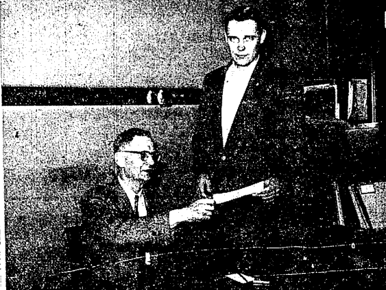
A LAST DITCH effort was made the latter part of last week and early part of this week to boost Farmington's United Fund and Community Chest Drive totals prior to the close of the campaign this Thursday.

Preliminary plans and cost estimates on the proposed water system to serve portions of the Farmington and Southfield areas will be available on November 20, according to township supervisor, announced this week.