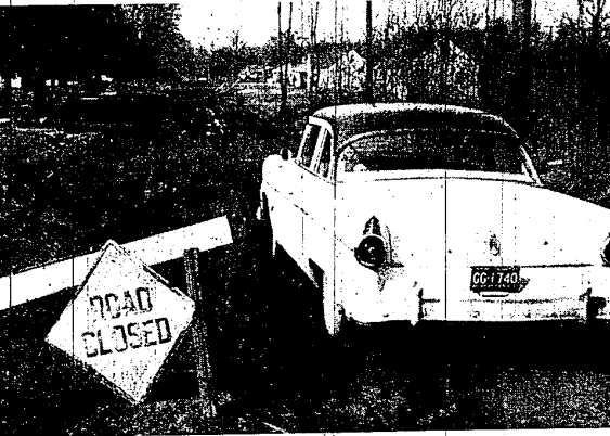
WARM SPRING days during the past two weeks had their unpleasant aspects as well as those of a more pleasing nature. As frost began coming out of the ground at greater depths, more and more deep ruts in roads with inadequate bases developed. By the latter part of last week several roads in the area had got deep so bad that it was necessary for drivers to park their cars at the nearest main intersection and "walk in."

The Annual Township Meeting will open at 1:00 p.m. this Saturday afternoon at the Town Hall. However, there are strong indications that a motion will be presented to adjourn the session to an evening hour at a later date. Officials explained that the Annual Meeting must be called to order at 1:00 p.m. on Saturday as prescribed by State Law.