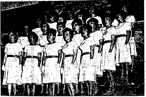
THE FESTIVAL OF MUSIC sponsored by the Kendallwood Kiwanis Club of Farmington was staged last Saturday evening in the North Farmington High School auditorium with a capacity crowd on hand to witness the program. In the picture at top, the Kendallwood, a talented women's chorus, presents one of the popular numbers enjoyed by the audience. In the other picture, the audience can be seen looking on as one of the instrumental band conductors raises his baton to lead a fine orchestral arrangement. The Kendallwood Kiwanis Club hopes to make the program an annual affair in Farmington.