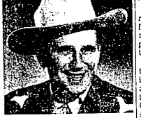
PEE WEE KING There will be a 2:15 p.m. matinee and 8:15 p.m. show.

There's a big time waiting Saturday for those attending the first show sponsored here by the Farmington Township Police Welfare Fund. Tickets are being sold many places in the township, and will be on sale at the door. Two shows will be held Saturday. The first at the Junior High School gymnasium of Thomas street.