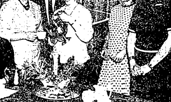
THE AMERICAN FIELD SERVICE Chapter of Farmington sponsored a tea last week at Farmington Senior High School to officially welcome two foreign exchange students now attending classes there.