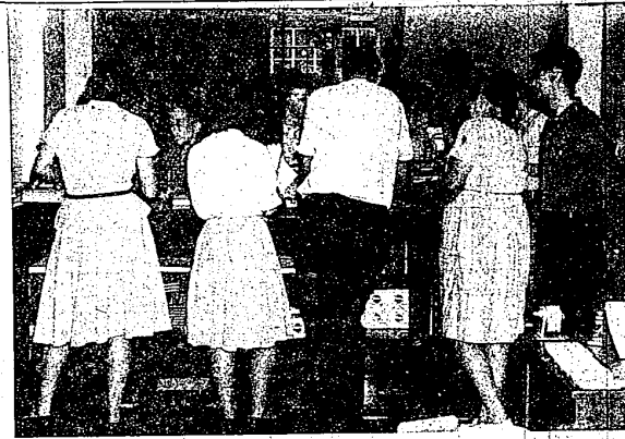
THE BOOK STORES in the Farmington School District are doing a big business since opening last week as can be seen in the picture above...