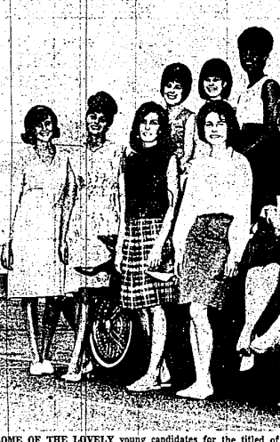
SOME OF THE LOVELY young candidates for the titled of Miss Founders' Festival, in the upcoming beauty contest. For full details, see all of the other events planned for Thursday, Friday and Saturday, see page two.