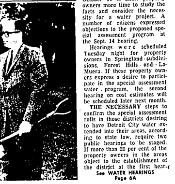
THE SUBDIVISIONS included in the proposed Pressure District are Springland subdivisions, Forest Hills subdivisions, Staman Acres, Pasadena Park, Crestview, Muer Farms, Glen Orchard and Farmington Hills, in addition to parts of Prestain and Little Farms subdivisions.

Glen Orchard and Farmington Hills are just two subdivisions in the Township which would be serviced in the proposed Pressure District. The area covered in the District approximately includes 1 1/2 square miles of Section 14, south of 1496; the east half of the southeast quarter of Section 15; and the south half of Section 22.