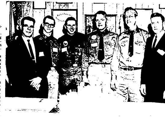
BOY SCOUT TROOP No. 35 of Farmington observed the 56th Anniversary of Scouting at a birthday celebration staged February 9 at the Farmington VFW Hall.

The Huskies at this point might as well have packed up and left Yukon as to try to contain Grimalda for the rest of the night.