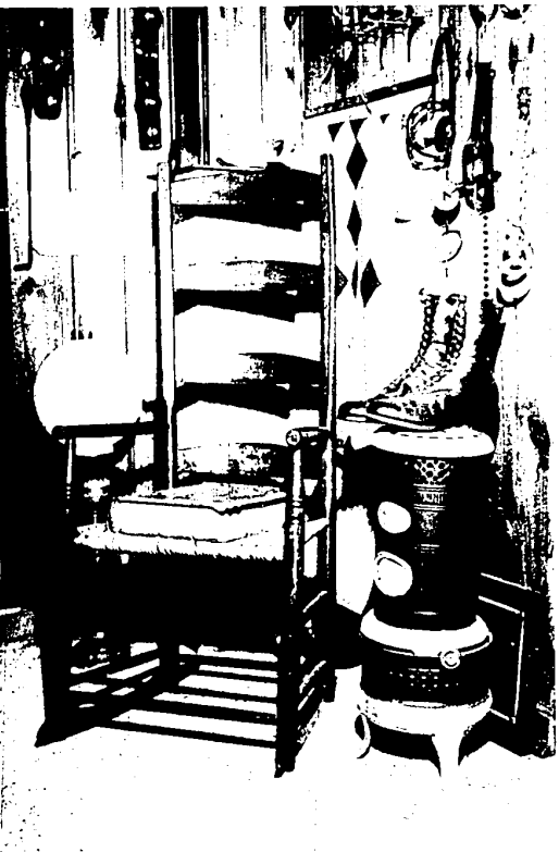
A TYPICAL corner at the Village Arcade sports a kerosene stove topped by Phyllis Diller-type shoes, an old restaurant lamp, a quilt, rocker, ancient leather tome and odd pieces of harness equipment.