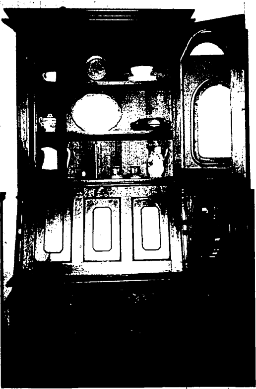
AN OLD WALNUT secretary is one of the most imposing pieces at the Village Arcade. It makes a fitting showcase for items of pewter and handpainted china.