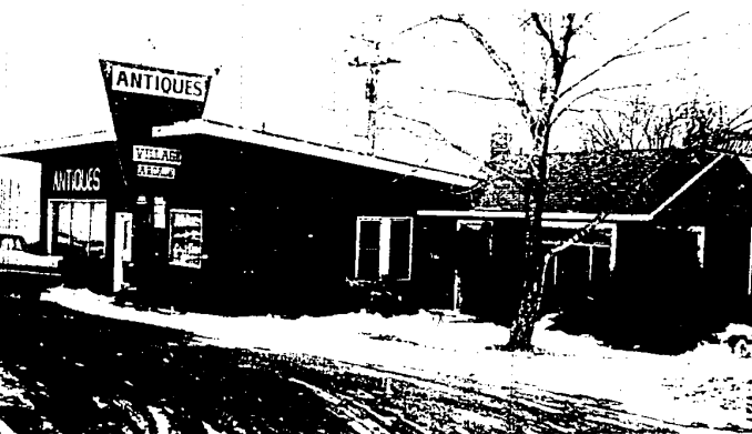
LOCATED ON Grand River just west of Halsted Rd., this headquarters for "antiques and zany junk" will soon be removed to make way for a gas station. It will move to the corner of 12 Mile and Novi Roads.