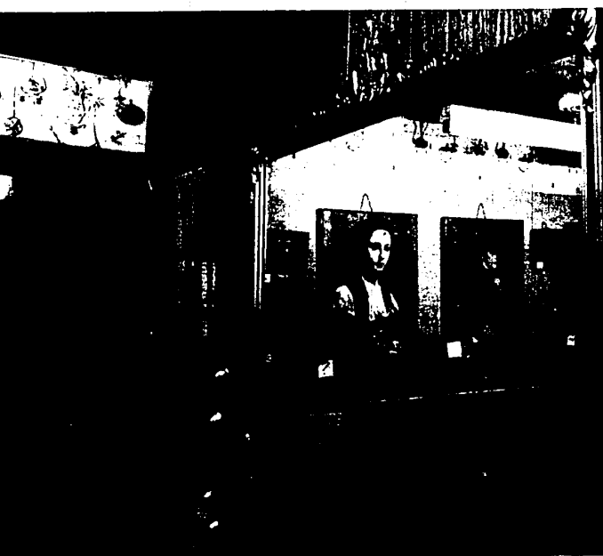
REFLECTED IN a handsome old mirror are some very authentic-looking reproductions of Renoir, Vermeer et al.