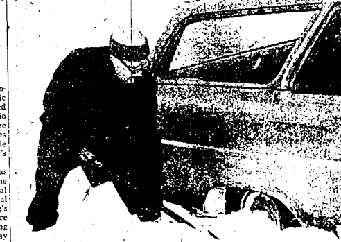
DIGGING OUT his car on Springfield Drive. He must be thinking that there are better means of transportation.