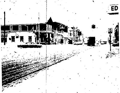
THE MAIN ROADS may have been plowed Friday morning, but the downtown area in the City was practically deserted. This picture was taken about 11 a.m. when the intersection is usually filled with cars.