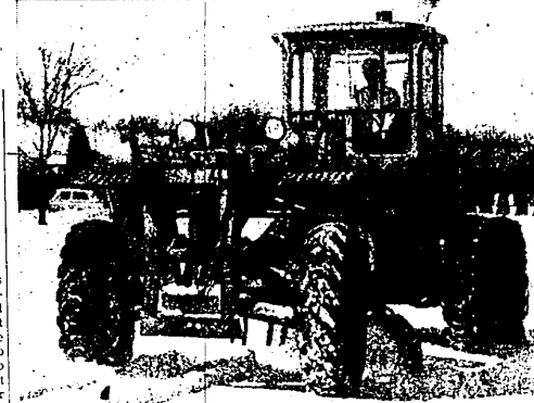
THE MOST WELCOME sight all weekend was the snow plow to clear out the roads. This was in the Springfield Subdivision.