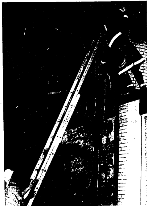
TOWNSHIP FIRE — A fire in a paint booth at Lockwood Manufacturing, 32840 Eight Mile Rd., Farmington, was quickly extinguished by the combined efforts of the city and township fire departments Monday night. Here firemen hook up a ventilating fan to vent the fumes.