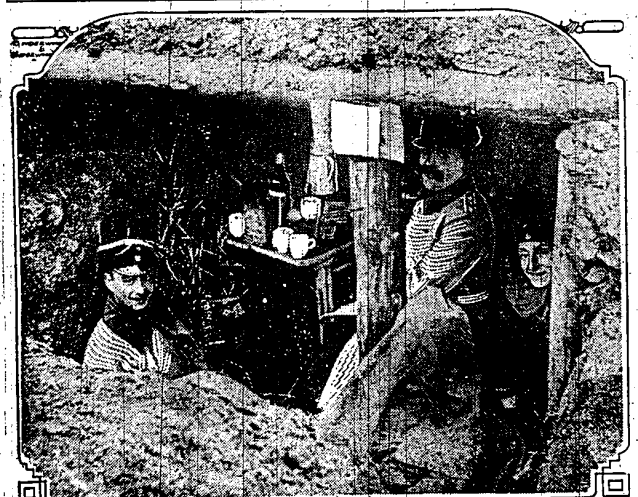
German officers in splinter proof shelter.

Never in modern warfare have trenches been used to such good purpose as the ones used respectively by the allies and the Germans on the field of action. The Germans have perfected the building and arrangements of their trenches to such a degree that were they compelled to remain in them, they could do so for months at a time with comfort. The trenches are built three feet deep on a scientific system in parallel lines and flanked by others, in which machine guns are concealed. At intervals in the interconnections there are splinter proof shelters.