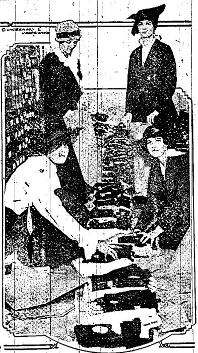
Packing kits for French soldiers in Vanderbilt hotel. The Vanderbilt hotel in New York city is the scene of unusual activity these days. Pretty society belles and equally charming society matrons whose names are to be found in the social registers and blue books are busily engaged in making up kits containing woolen gloves, woolen Sox, woolen underwear, heavy mufflers, handkerchiefs, abdominal belts and soap. These kits, gotten up at an expense of two dollars each, are being sent to French soldiers in the trenches.