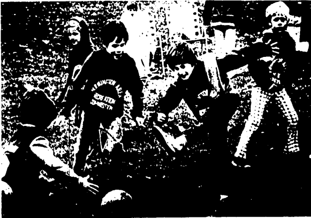
The action in Saturday soccer is fast, furious, but friendly.