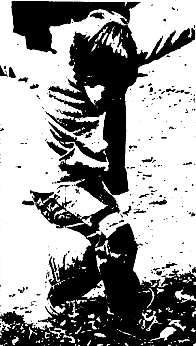
Style and balance are an important part of soccer, plus keeping your eye on the ball.