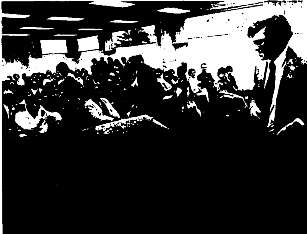
U.S. Rep. William Brodhead prepares to present his dedication speech to the group of area residents gathered in the conference room of the new library.