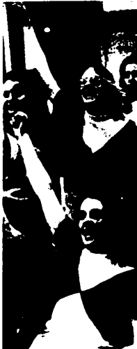
Despite the loss, Mercy cheerleaders maintained their spirit.