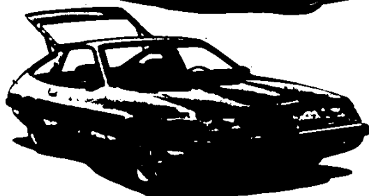
STARFIRE. Who says you can't get good gas mileage in a sporty car? Check out Starfire, Starfire SX and the available Starfire GT option — Oldsmobile's supercoupes.