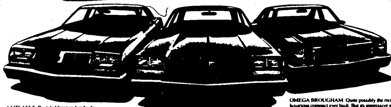
CUTLASS S. Restyled front end and sides. The new look is bolder, sportier. All this — and surprising gas economy, too.